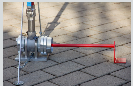
iconos® End support prevents the last sprinkler in the row from tipping over.